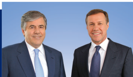
Dr. Josef Ackermann